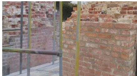
CRT Trainees rebuild part of the corner post using reclaimed bricks and lime mortar