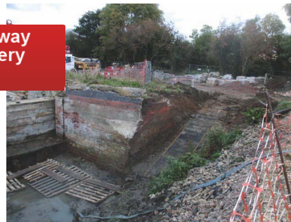
Access cut down to the upstream wing wall to enable a concrete floor (shown left) to be poured for work to proceed on re-pointing and cutting in new stop board recess

walls are approaching the final stages of rebuilding so some other work, essential to the locks operation, needed to be started. This work included preparation of the wing walls and rebuilding the four corners.