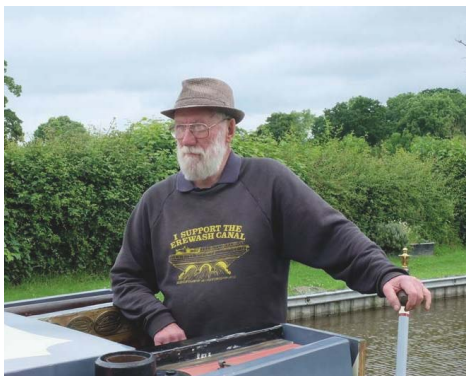
On the Tiller