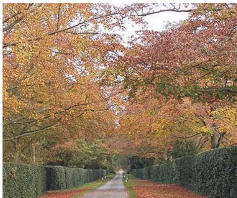
A 'roof' of autumn colour on a road near Whatton in the Vale

First up is the Community Christmas Lights event on Friday 25 November from 3.00pm to 5.30pm at the Cotgrave Shopping Centre . Local organisations and businesses will be setting up stalls there for the afternoon. Then on Saturday 26 November the Christmas lights will be switched on in West Bridgford town centre. Seasonal festivities throughout the day will include street entertainment, fairground rides and ice skating plus there'll be a variety of food and gift stalls. The big switch on will be at 5.00pm followed by a firework finale. At the other end of the canal, Grantham will be putting on 'Christmas on the Green, including Christmas Lights Switch On' on Sunday 27 November between 10.00am and 4.30pm. Again, lots to keep you entertained including stalls, fairground rides, Santa's grotto and refreshments.