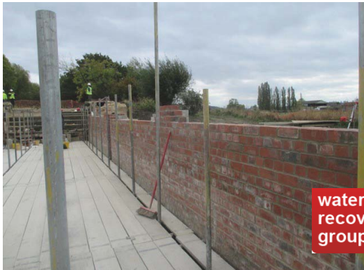
Inner brickwork nearing the top showing the scaffolding before being raised for the final time.

WRG were on site during October and good progress was made. The lock walls are approaching the final stages of rebuilding so some other work, essential to the locks operation, needed to be started. This work included preparation of the wing walls and rebuilding the four corners.