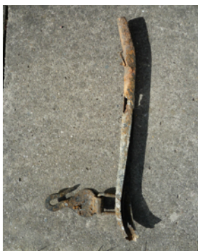
Object found in the canal at Harlaxton